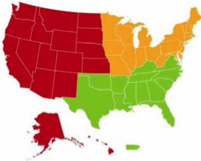
Figure 1. Cohesive Strategy Regions: Northeast, Southeast, and West

Phase II was directed by the Cohesive Strategy Sub-Committee (CSSC), which is composed of representatives of federal and state land management agencies, tribes, industry groups, counties, municipalities and non-governmental organizations. An RSC was formed in each of the three regions. Public outreach was conducted in each region, in the form of focus groups and forums to increase awareness of the Cohesive Strategy process and to gather input regarding local and regional perceptions. Following the forums, the RSCs reviewed the public input and developed their objectives, with a catalog of actions and options for risk reduction.